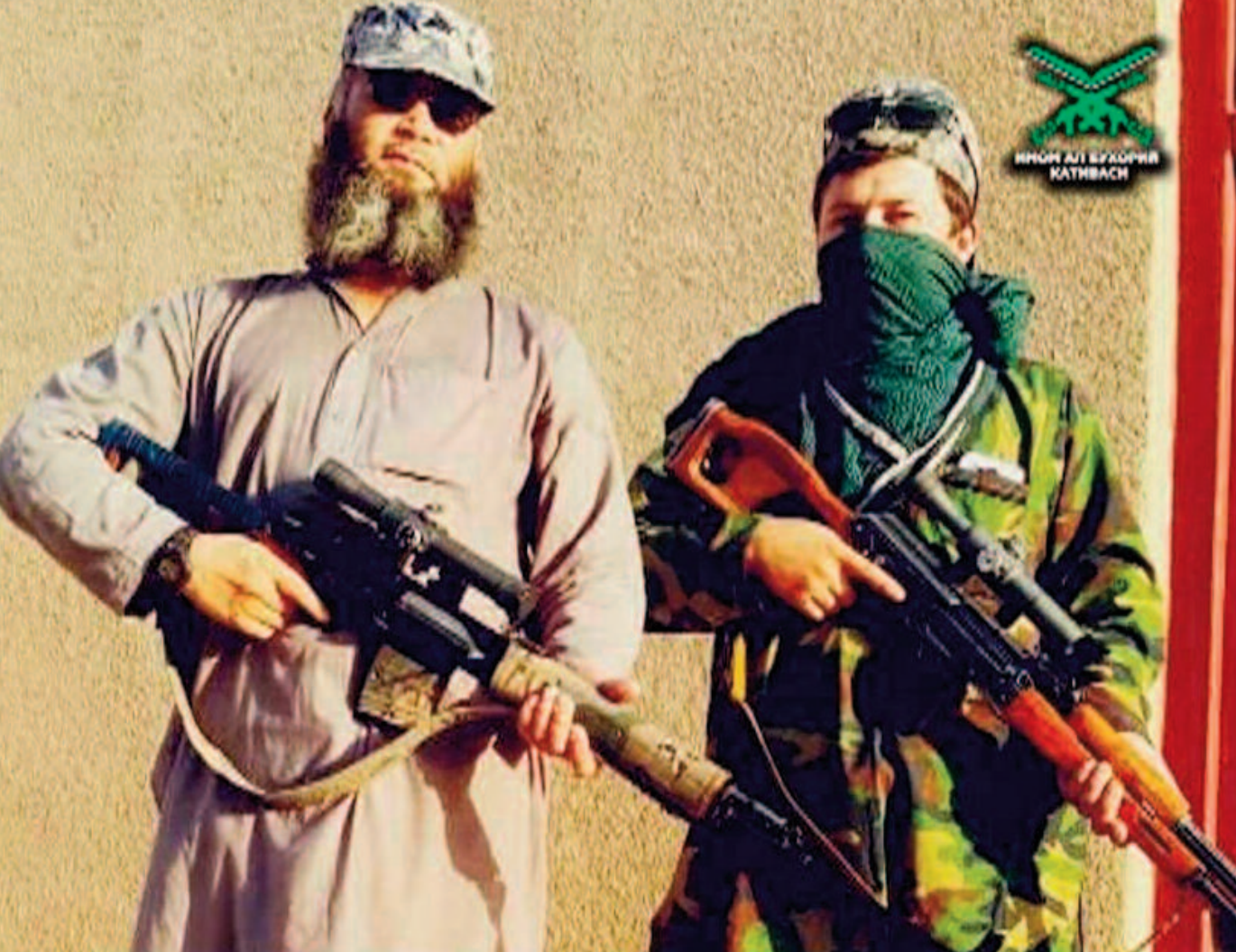
Snipers of Katibat Imam al Bukhari in Afghanistan

Tajikistan. This means that Uzbek jihadists are closer and closer to their homes, where they intend to create an Islamic Caliphate. The KIB, IJU and TIP continue to attract followers, gain battlefield experience and make international connections.