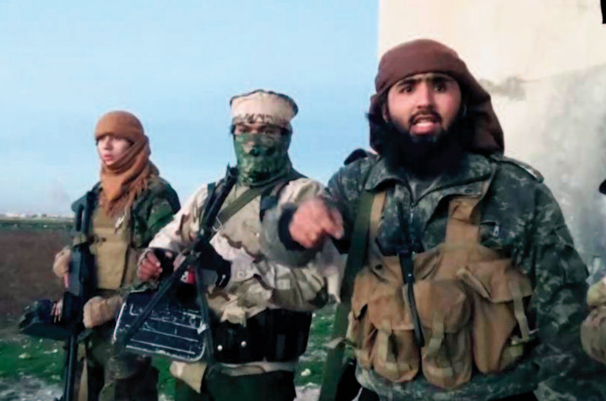
Former KTJ leader Abu Saloh

itants are the most combat-ready, well-equipped and largest group among the Central Asian foreign jihadist groups in Idlib Province. The approximate number of KTJ militants is about 500 people.