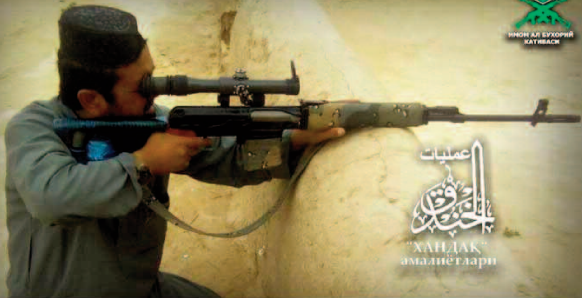
ИМОН АЛ БУХОРИЙ КАТИБАСИ МУЖОХИДЛАРИ "ХАНДАҚ" АМАЛИЁТЛАРИДА

Militant of Katibat Imam al Bukhari in the joint terror operation Khandak with the Taliban